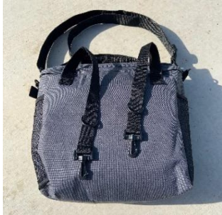
Clip the Hook to the D-ring