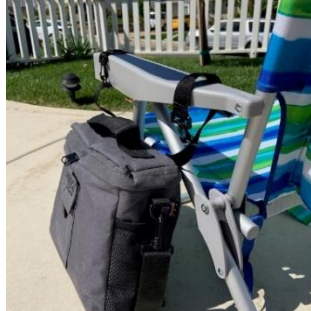
Roll Cooler into the chair