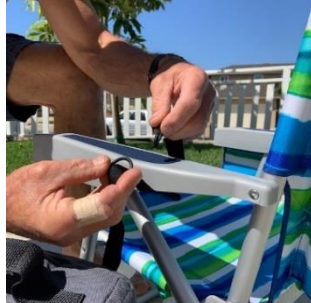
Attached Front Mount Strap