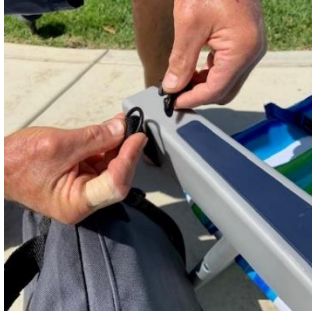
Mounted Cooler Tote